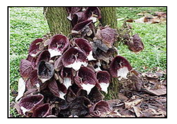
A. arborea flowers

A.bracteolata is used in Sudanese folkloric medicine for the improvement of health by increasing body weight and treatment of various disorders. Bovanstype chicks were fed 10% A.bracteolata seed and 5% mixture of A.bracteolata and Astragalus gummifer of standard diet for two weeks. The given concentration mixture of the plants were toxic but not lethal to chicks and caused reduced body weight gain. Mild diarrhoea was observed in te chicks on the 5% mixture of two plants. Alteration of serum AST and ALT activities and total protein, albumin, globulin, cholesterol and uric acid were correlated with changes in haematology and pathological effects on vital organs<sup>19</sup>.