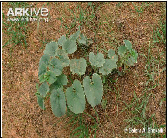
Figure No.2: Leaf of Aristolochia