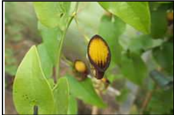
A. pontica flower Figure No.1: Species of Aristolochia