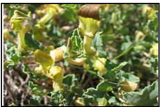
A. pistolochia flowers