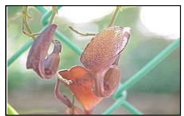
A. maxima flowers